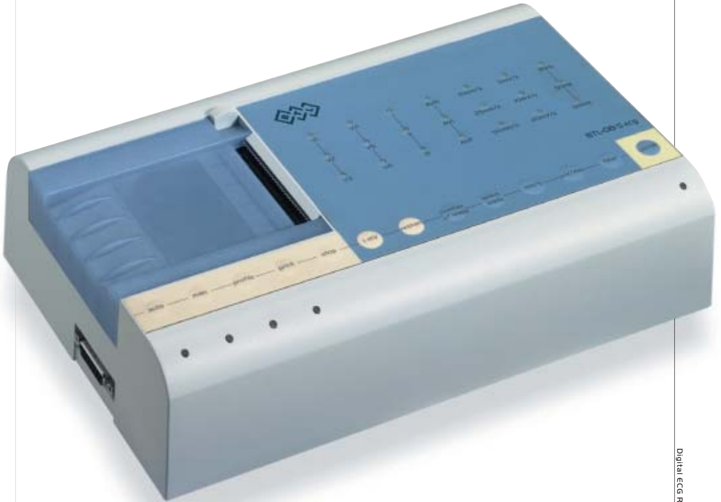
Digital ECG Recorders II

Standard accessories: patient cable, set of chest electrodes (6pcs), set of clamp electrodes for extremities (4pcs), ECG gel (0.2l), paper role (58mm), power cord, user manual